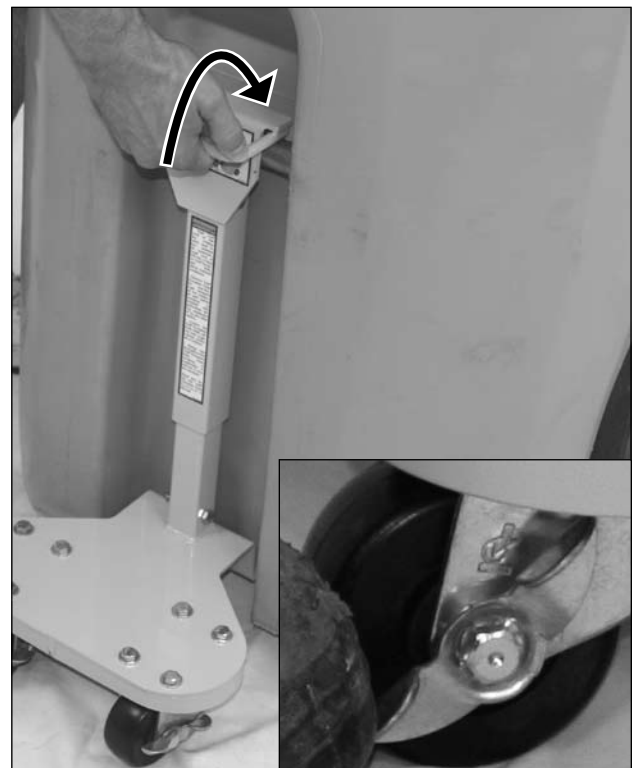
3) Secure the top hook of the Troll® EZ Wheel™ over the bar on the container. ALWAYS set the brake when the container is unattended or remove the Troll® EZ Wheel™ from the container.