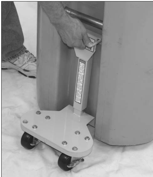
1) Place the lower hook of the Troll® EZ Wheel™ under the front edge of the container.