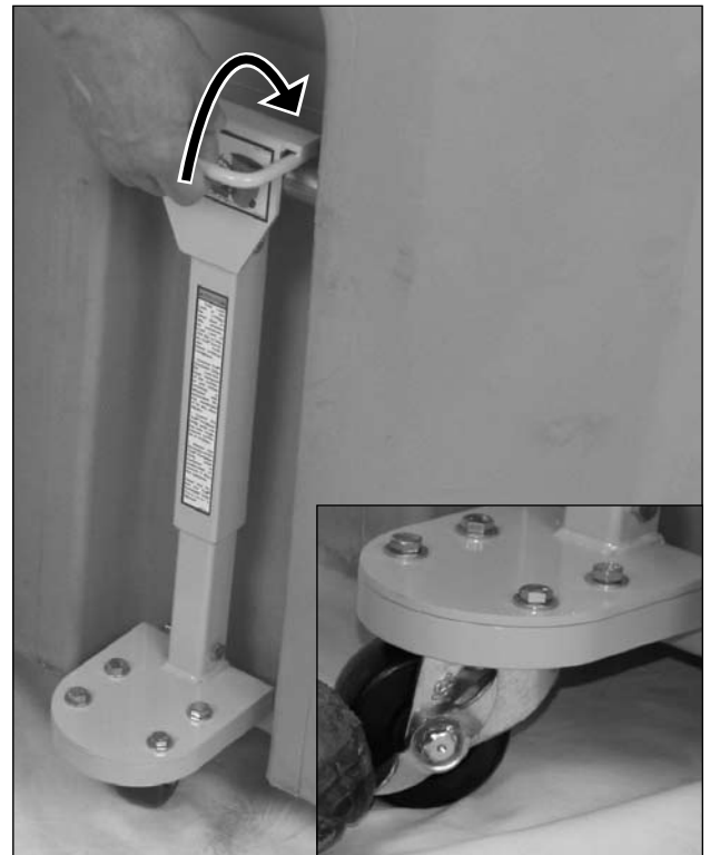
3) Secure the top hook of the Troll® EZ Wheel™ over the bar on the container. ALWAYS set the brake when the container is unattended or remove the Troll® EZ Wheel™ from the container.