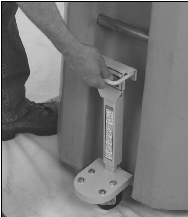
1) Place the lower hook of the Troll® EZ Wheel™ under the front edge of the container.